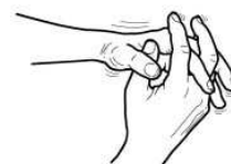
2. Wash Between fingers