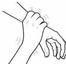
3. Wash back of hands