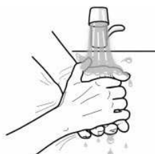
1. Wash Palms